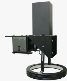
CCD laser system